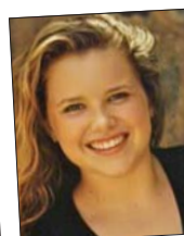
Marissa Center for Tomorrow's Leaders

I want all the people who support YFC to know that what they are doing is helping the youth at Campbell to grow. This club and what we talk about really makes a difference in student's lives. The future will be different because of what they are doing to support H.Y.P.E.