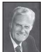
Dr. Billy Graham , World Evangelist, First Full-time YFC worker

"Youth For Christ has played a vital role in my life and ministry.... Youth For Christ has always been on the cutting edge of youth evangelism.... I hope you will support them all you can."