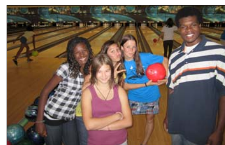
Military Youth Ministry - Club Beyond Knockout Club Launch