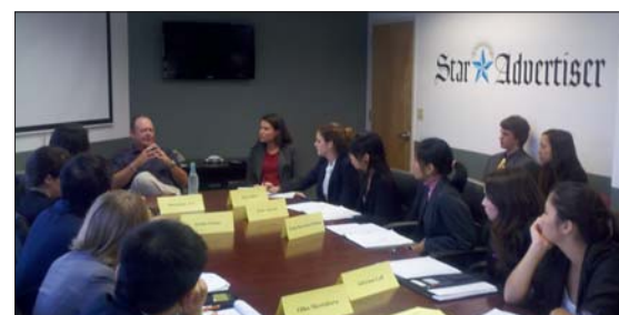
Center for Tomorrow's Leaders Leadership Academy