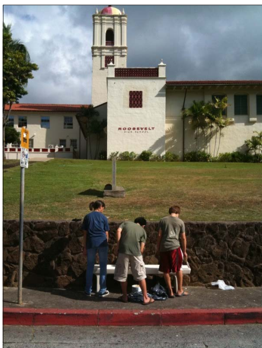
Campus Life Roosevelt High School Service Project