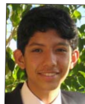
Michael Center for Tomorrow's Leaders

Recently I got to spend an entire week with the leader of Club Beyond at Schofield Barracks. Besides introducing me to other students who shared some of my own experiences, he put some of my gifts to good use, got me out of my house every day, invited me to other activities, and, most of all, he got to know the story of my life and some of my struggles.