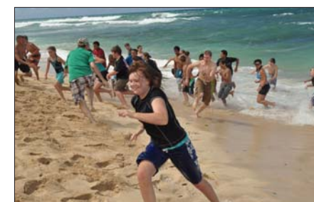
Military Youth Ministry - Club Beyond Storm da Beach