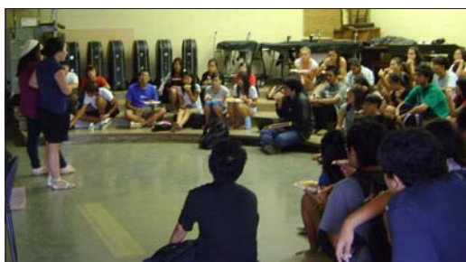
Campus Life Kalani High School - CORE Club