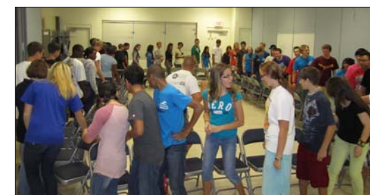
Military Youth Ministry - Club Beyond Schofield Club Beyond