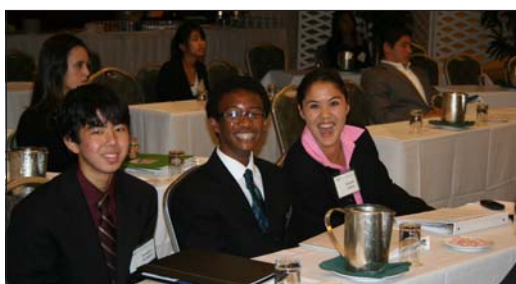
Center for Tomorrow's Leaders Opening Retreat