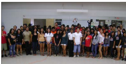
Campus Life Campbell High School - H.Y.P.E. Club