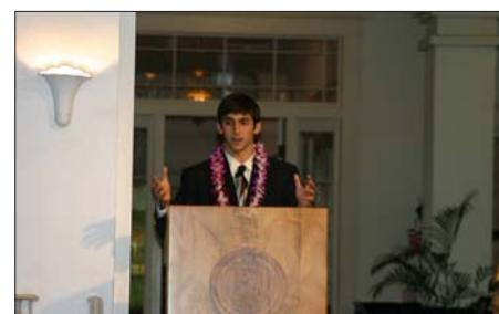
Center for Tomorrow's Leaders Graduation at Washington Place