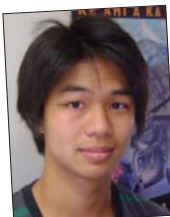
Beldon Kalani HS – Campus Life

It started three years ago when I was in a classroom during lunch finishing up a test. Kids started piling up in the room, music was playing and someone offered me a burger. Before you knew it I was at my first club meeting.